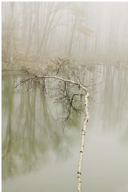
Ashokan Birch