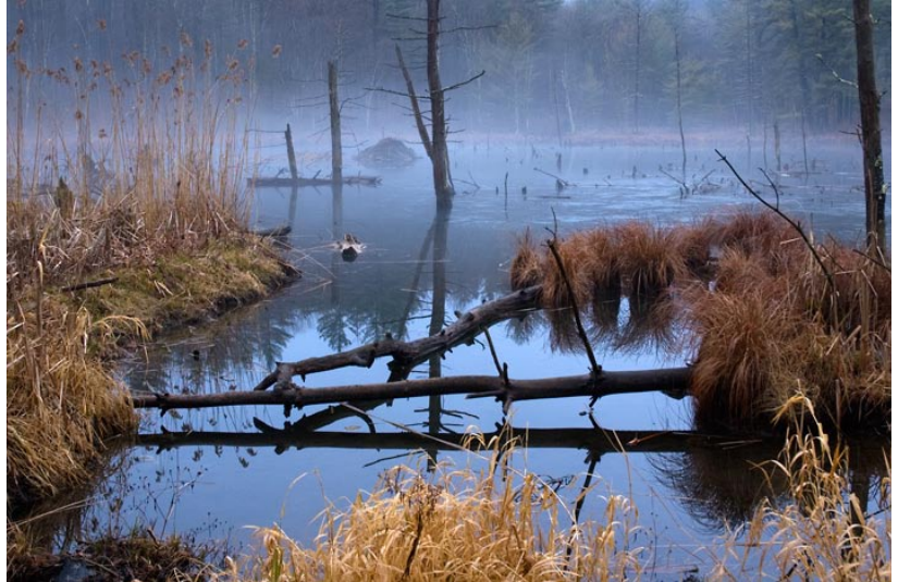
Beaver Pond Winter Fog