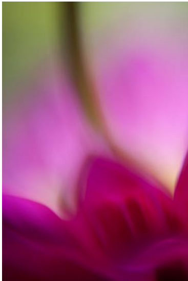
Skywalker Dahlia (Lensbaby)