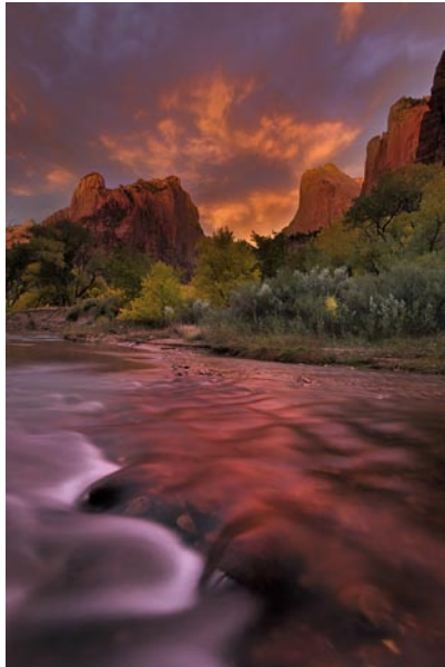
Gift of Light Sunrise over the Court of the Patriarchs, Zion National Park, Utah

For an in-depth look at Joe's work, information on photo tours and workshops, eBooks and free instructional articles and videos, please visit http://www.josephrossbach.com/index.html ; http://www.naturephotographers.net/onlinecourses .