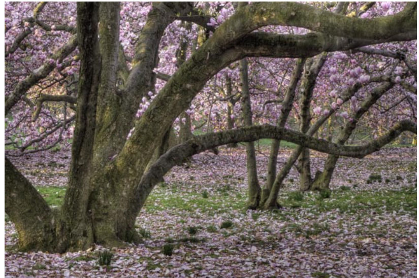
Magnolia Trees (HDR)