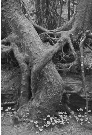
Entwined Trees