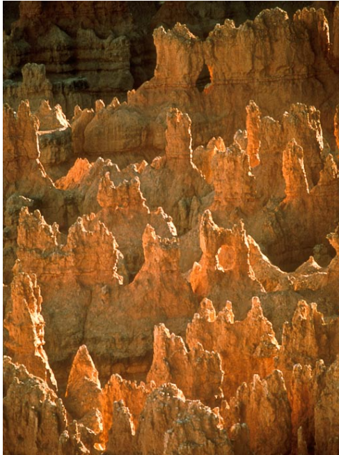
Bryce Canyon National Park

Suggested donation $5.00 • Optional dinner after each meeting. The restaurant will be announced at the meeting.